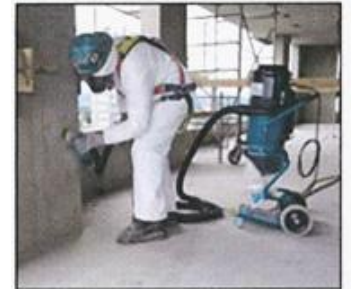
Worker grinding concrete using local exhaust ventilation

The use of respirators to prevent exposure is not acceptable as a primary control when other control measures are available.