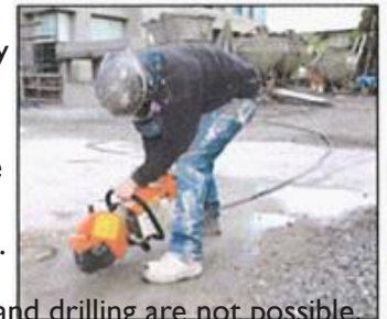
Worker cutting concrete using water for dust control