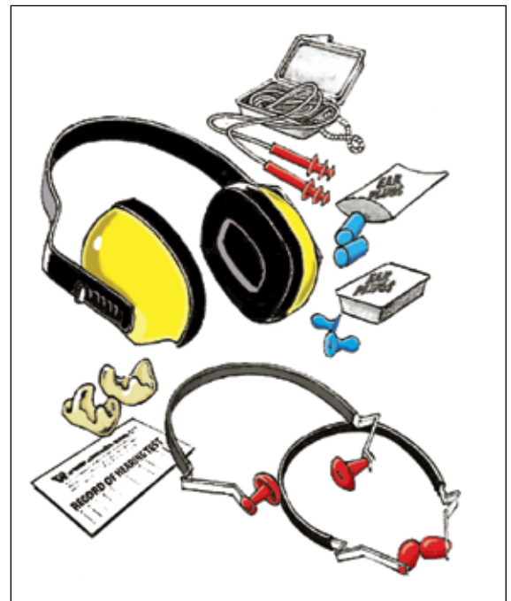
There are many options for hearing protection on a construction site.