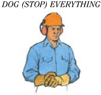
Clasp hands in front of body.