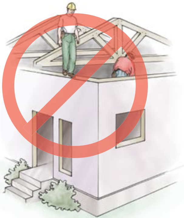
Workers must not walk on top plates of walls.