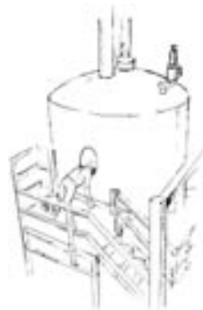
This process vessel at a pulp mill is a confined space. One worker died inside the vessel from lack of oxygen, and another died with his head in the opening.