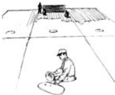
The flotation compartment of a barge is a confined space that may not have enough oxygen to sustain life.